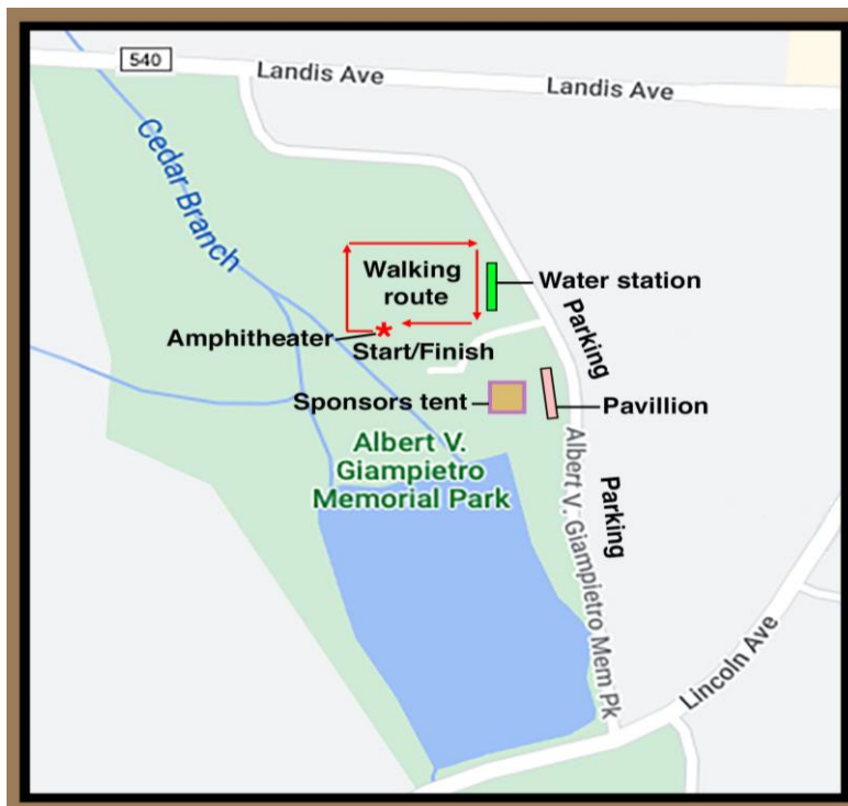
Albert Giampietro Memorial Park, Vineland, NJ