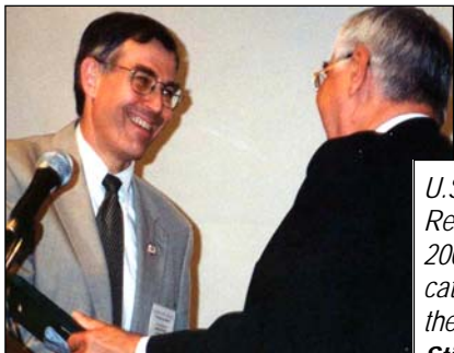
U.S. Congressman Rush Holt accepts Special Recognition Award for serving as a NAMI NJ 2003 Walk Honorary Chair. He urged advocates to contact legislators about parity and the importance of the "Freedom from Stigma" Walk in sending a strong message.