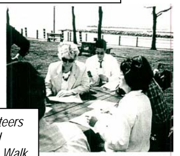
Volunteers attend onsite Walk Planning Committee Meeting at Liberty State Park.

For contact information on Campaign activities see reverse side of Bulletin.