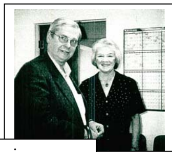
Trainers, coordinators and presenters prepare to expand In Our Own Voice