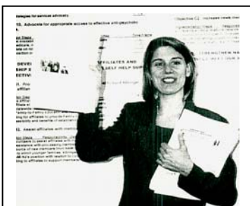
Media Training offers pointers for working with the media.