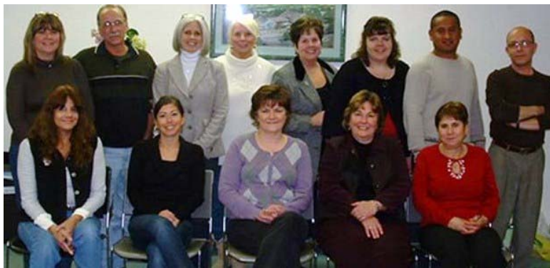
Celebration - NAMI-Sussex’s Family-to-Family class graduates, teachers and guests celebrated the completion of the 12-week course on Dec. 2. with a covered dish dinner.